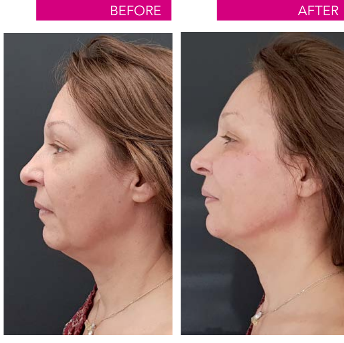
UPHA