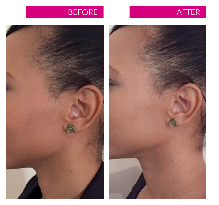
UPHA