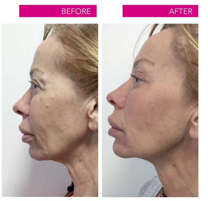
UPHA